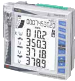
WM30 / WM40