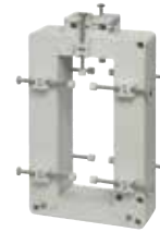
CTD 8/9/10/11 S, V, H, Q