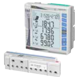
WM50 and TCD12